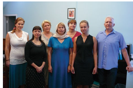
Our choir, August 10, 2014