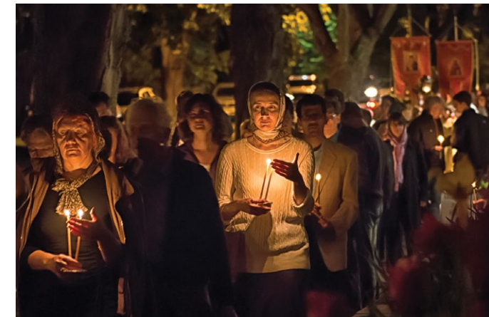
Paschal procession 2014