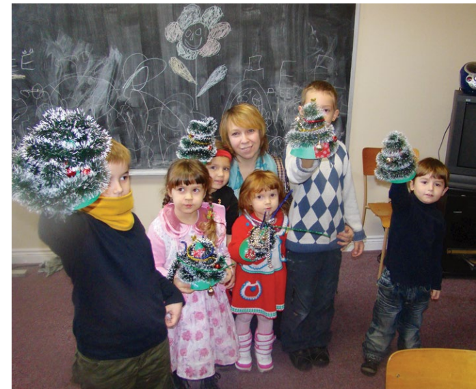
Sunday school class, 2011