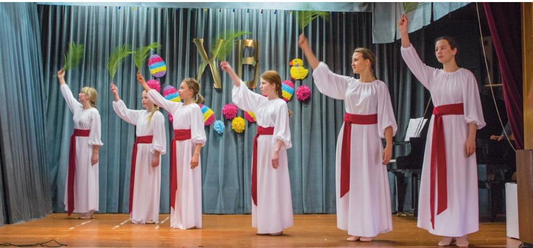
Easter concert on April 27, 2014